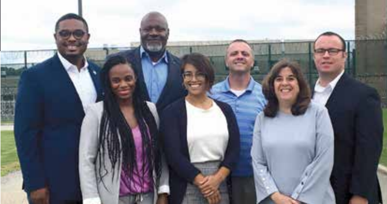
In August I joined other members of the Allegheny County House Delegation to take a tour of SCI-Somerset, where we got a firsthand look at the challenges facing the Pennsylvania criminal justice system.